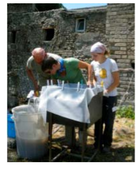
The material from Pompeii's latrines are run through a flotation machine to separate seeds, bones and other small items from the soil.

"The archaeology [of food and drink] has risen to prominence in recent years towards exploring areas traditionally unexamined by classicists and archaeologists of the 19th and 20th centuries," she says. The early diggers understandably preferred the magnificence of monumental and imperial archaeology, like temples and palaces, but lacked diligence towards the understanding of everyday ancient lives.