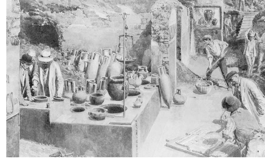
The unexpected, massive eruption of Vesuvius buried Pompeii and other nearby cities, leaving a trove of buried treasure to be unearthed by historians and archaeologists over a thousand years later.

"We hear a lot about Roman standards of plumbing, but in this part of Pompeii the arrangements were fairly basic," he points out. Few houses had