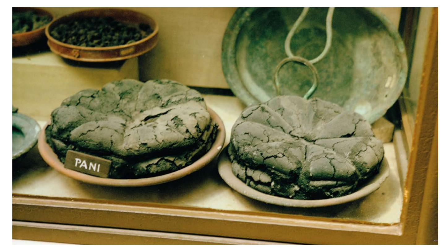
Bread was a staple back in Roman times. Although bread was primarily the food of plebians, the average working citizens of Rome, it was also eaten by the rich.

gists have also found a good cross-section of different rubbish that has given an interesting picture of what was going on in Pompeii's economy prior to the eruption.