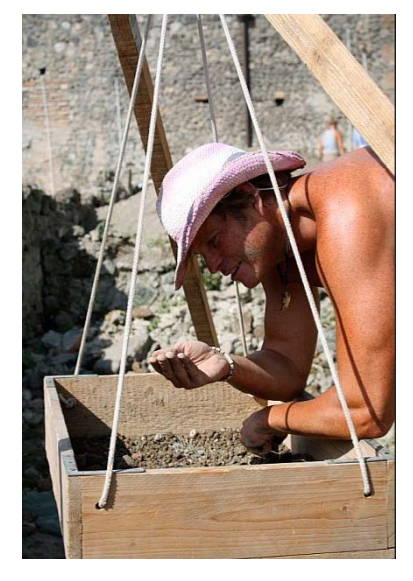
Excavated soil is carefully sifted to identify small shards of pottery and bones – a painstaking and time-consuming process.